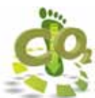
Reduce your carbon footprint

VeryPC is a recognised supplier on the Energy Efficiency Financing Scheme (Carbon Trust Loan Scheme replacement) from the Carbon Trust and Siemens Financial Services. The scheme is available to all kinds of businesses (SME & Large Enterprise) and organisations including educational institutions, charities and public sector bodies. Energy Efficiency Financing from Siemens Financial Services can be arranged for amounts as little as £1,000 upwards and, assuming the proposed Energy Efficiency Financing project passes the energy saving assessment by Carbon Trust Implementation Services. The energy savings are calculated on the savings projected from the project