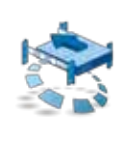
Rack mountable models available