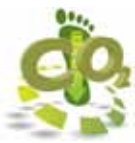
Reduce your carbon footprint

VeryPC is a recognised supplier on the Energy Efficiency Financing Scheme (Carbon Trust Loan Scheme replacement) from the Carbon Trust and Siemens Financial Services. The scheme is available to all kinds of businesses (SME & Large Enterprise) and organisations including educational institutions, charities and public sector bodies. Energy Efficiency Financing from Siemens Financial Services can be arranged for amounts as little as £1,000 upwards and, assuming the proposed Energy Efficiency Financing project passes the energy saving assessment by Carbon Trust Implementation Services. The energy savings are calculated on the savings projected from the project