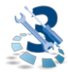
3 year warranty as standard